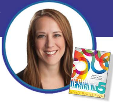
Angela Freese Design in Five Oct 15 or 16